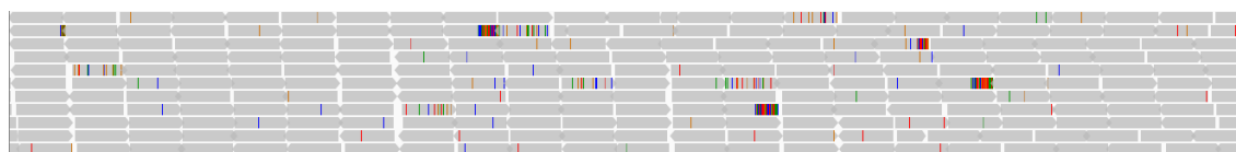
Figure 3: Simulated reads mapped in proper pair. Mismatches and soft-clips are shown as colored vertical lines in reads.